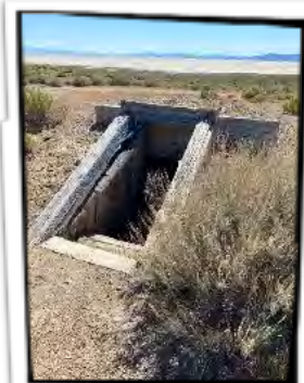
Abandoned mine shaft near Cassidy Mine Road