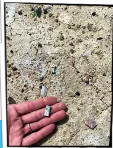
Pulling non-magnetic brass bullet casings and glass out of the ground around the Hot Springs by hand