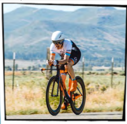
Northern Cal Nevada Time Trial, 2018

FOR MORE DETAILED INFORMATION VISIT: www.trialscienceinc.com