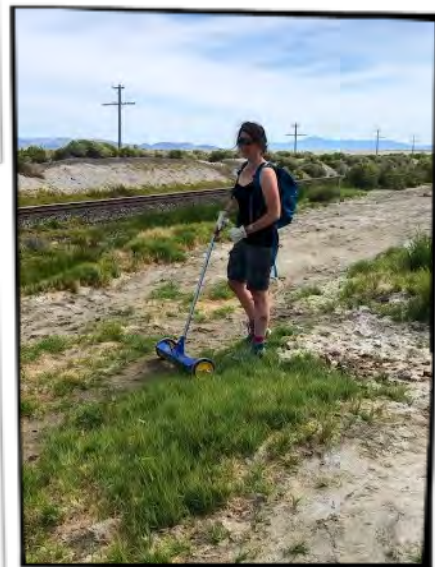
Cleaning up Trego Hot Springs Pulling metal debris out of the ground with a magnetized rake