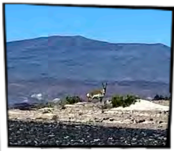
A lone male pronghorn keeps a close eye on us near Soldier Meadows Road

The morning's cleanup activities were followed by several talks on rocks and rockets, all of which was so fascinating I failed to notice the epic sunburn blooming on my sheltered-for-too-long-in-place back and shoulders.